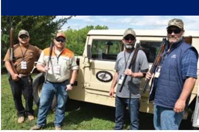
The SteelFab Team posing for a picture during the shoot.