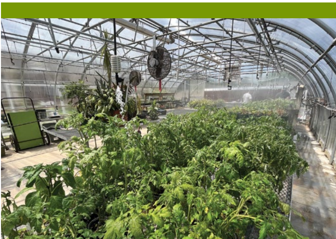
An inside look at the renovated greenhouse, complete with irrigation and cooling systems.

One of Holy Angels most popular programs on campus is horticulture therapy which started more than 25 years ago. After decades under the hot sun, our greenhouse needed significant renovations.