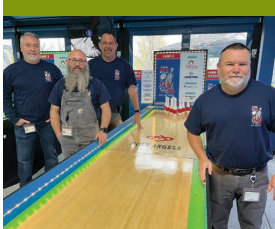
Our maintenance team designed and hand-crafted three bowling lanes for Angel Bowl.