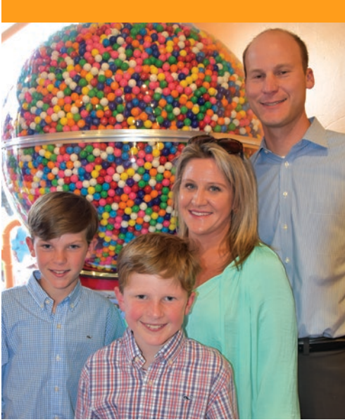
The Kines' family when they donated "Big Momma" in 2017.