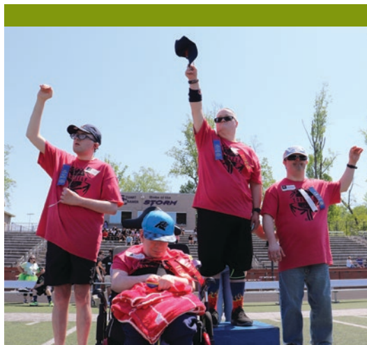
All of our resident-athletes were champions at the Special Olympics.