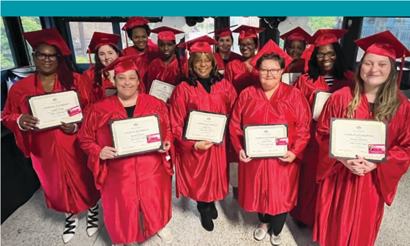
Congratulations to our graduates of the College of Direct Support.